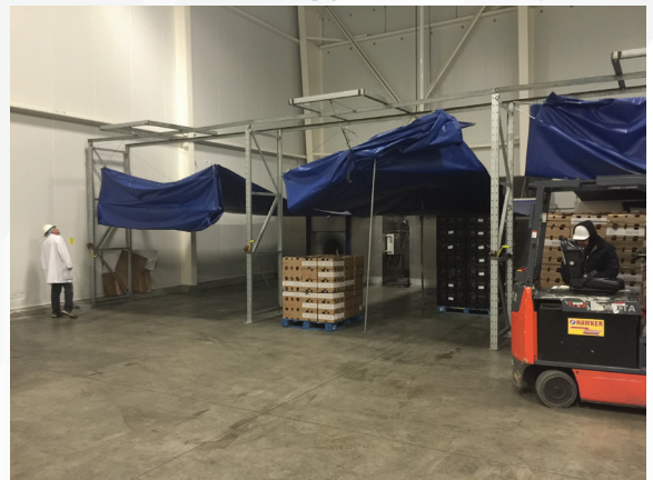
Replaces Conventional Tarp Cooling